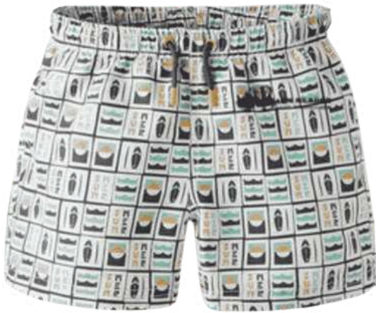
BK-2175 PRINTED BERMUDA SWIM SHORT

BERMUDA SHORTS WHICH CONTAIN INNER LINING WITH AN ELASTIC WAISTBAND AND ADJUSTABLE DRAWSTRINGS AT THE FRONT. A PATCH POCKET ON THE BACK AND SUBLIMATION PRINTED AND A PRINTED LOGO ON THE FRONT.