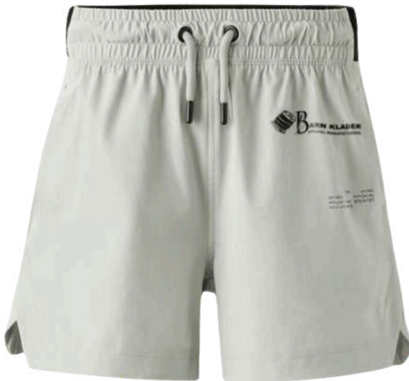
BK-2178 SPORTY TECHNICAL BERMUDA SHORT

BERMUDA SHORTS WITH AN ELASTICATED WAISTBAND AND ADJUSTABLE DRAWSTRINGS. FRONT POCKETS AND A PRINTED LOGO ON THE FRONT.