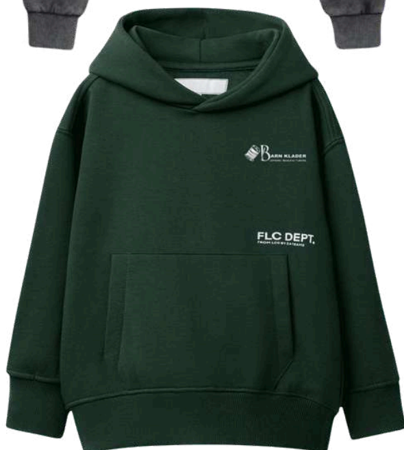
BK-2202 PRINTED FLEECE HOODIE 80/20

LONG SLEEVE HOODED SWEATSHIRT WITH RIBBED CUFFS. ACID WASHED FLEECE OUTER FABRIC. AND A PRINTED LOGO ON THE FRONT.