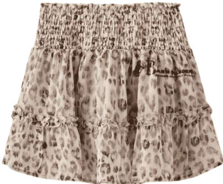
BK-2207 FLORAL SKIRT

SKIRT WITH AN ADJUSTABLE INNER WAISTBAND AND PRINTED FLORAL DESIGN ON FRONT AND A PRINTED LOGO ON THE FRONT.