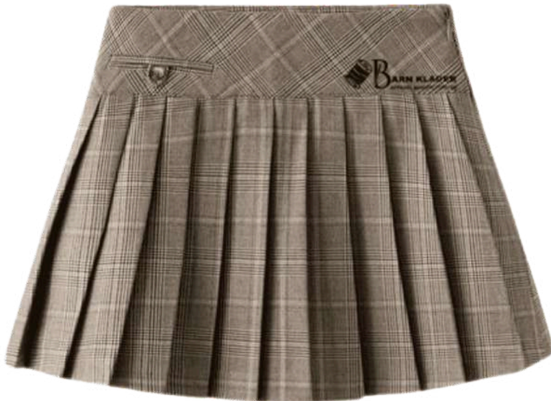
BK-2206 PLEATED CHECK SKIRT

SKIRT WITH AN ADJUSTABLE INNER WAISTBAND AND INVISIBLE SIDE ZIP FASTENING. FRONT POCKETS WITH BUTTON APPLIQUÉ AND A PRINTED LOGO ON THE FRONT.