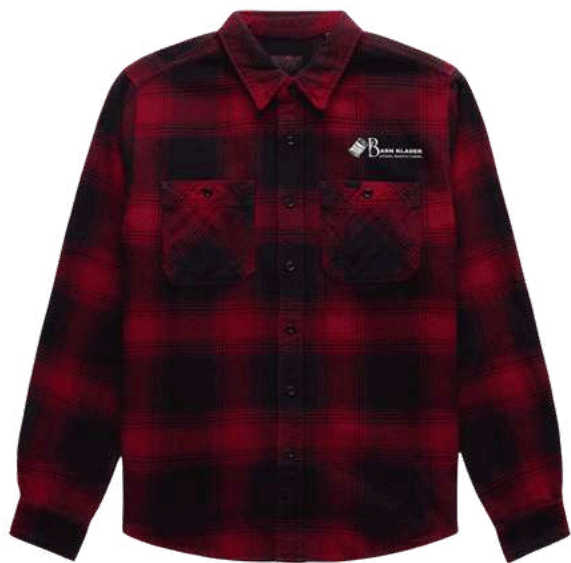
BK-2188 CHECK SHIRT

SHIRT MADE IN 100% YARN DYED COTTON CHECK FLANNEL FABRIC VERY SOFT AND COMFORTABLE WITH BLACK BOTTONS ON FRONT PANELS AND CUFFS AND A PRINTED LOGO ON THE FRONT.