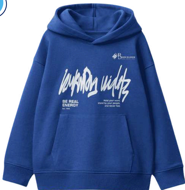
BK-2172 PRINTED FLEECE HOODIE 52/48