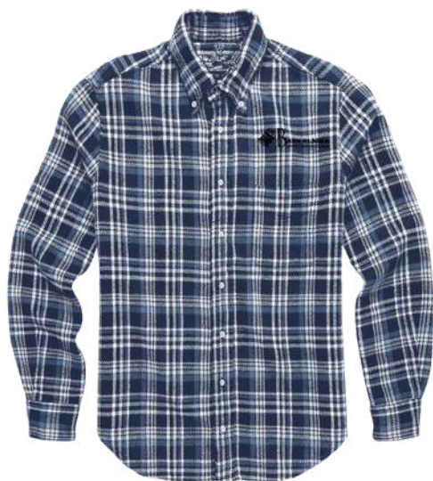
BK-2189 CHECK SHIRT

SHIRT MADE IN 100% YARN DYED COTTON CHECK FLANNEL FABRIC VERY SOFT AND COMFORTABLE WITH BLACK BOTTONS ON FRONT PANELS AND CUFFS AND A PRINTED LOGO ON THE FRONT.