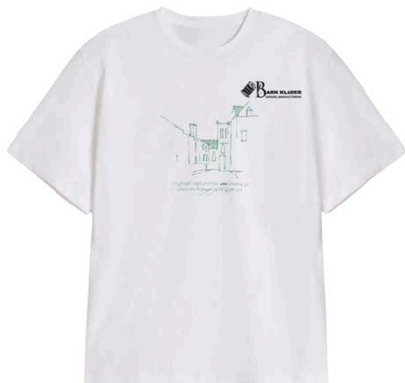
BK-2191 GRAPHIC T-SHIRT

T-SHIRT MADE IN 100% COTTON COMBED JERSEY FABRIC VERY SOFT AND COMFORTABLE WITH PRINTED DESIGN ON FRONT AND A PRINTED LOGO ON THE FRONT.