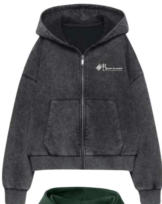
BK-2203 ACID WASHED FLEECE HOODIE

HOODED SWEATSHIRT WITH LONG SLEEVES. FRONT KANGAROO POCKET. EMBROIDERED BOW DETAIL ON THE CHEST AND CONTAIN RIB ON CUFFS AND HEM AND A PRINTED LOGO ON THE FRONT.