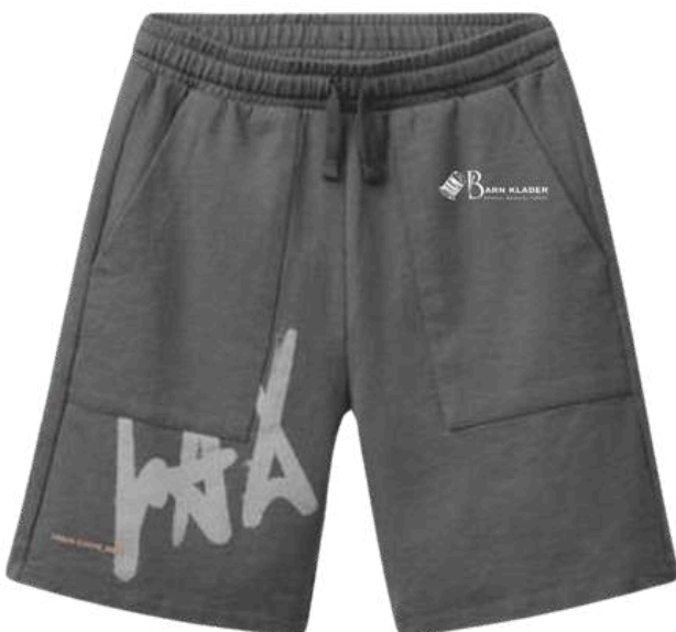
BK-2199 PRINTED CASUAL SHORT

CASUAL SHORTS WITH AN ELASTIC WAISTBAND AND ADJUSTABLE DRAWSTRINGS AT THE FRONT. SCREEN PRINTED PRINTED ON FRONT AND A PRINTED LOGO ON THE FRONT.