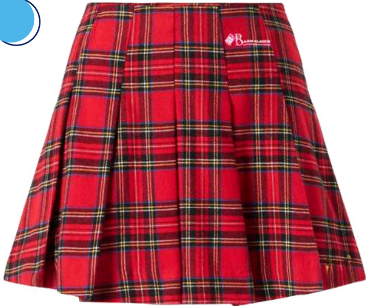
BK-2180 PLEATED CHECK SKIRT

SKIRT WITH AN ADJUSTABLE INNER WAISTBAND AND INVISIBLE SIDE ZIP FASTENING AND A PRINTED LOGO ON THE FRONT.